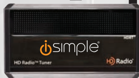
HD Radio™ Tuner (sold separately) Part #: HDRT